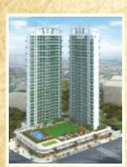
GREEN WOODS Kharghar