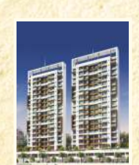
SAI PROVISO AASHLESHA Koparkhairane