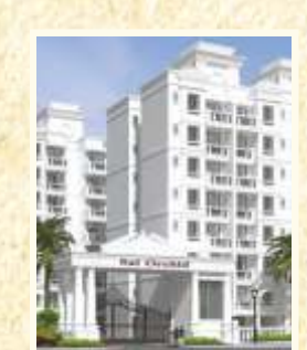
SAI ORCHID PHASE 1 Dombivali East